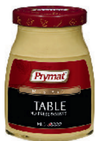
Table mustard mild

net weight : 185 g no. of items in a collective packaging : 9 pcs. no. of items on a pallet : 2 376 pcs. shelf life : 12 months language version : pl/en